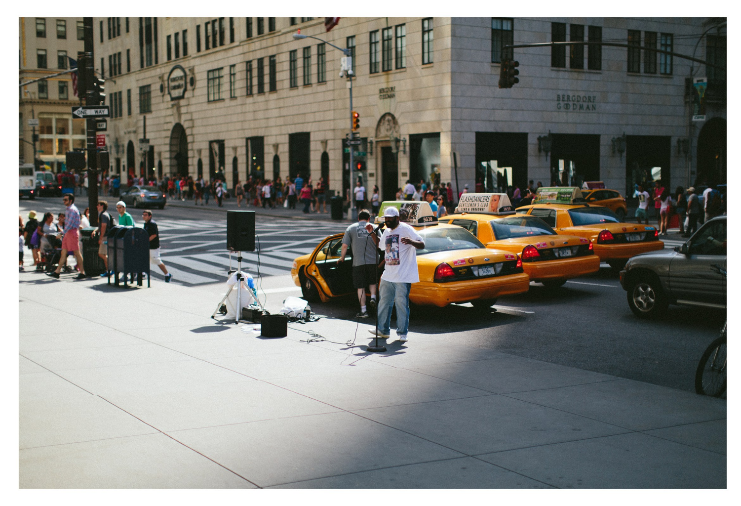
5TH AVE, NEW YORK