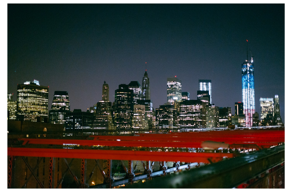
BROOKLYN BRIDGE, NEW YORK