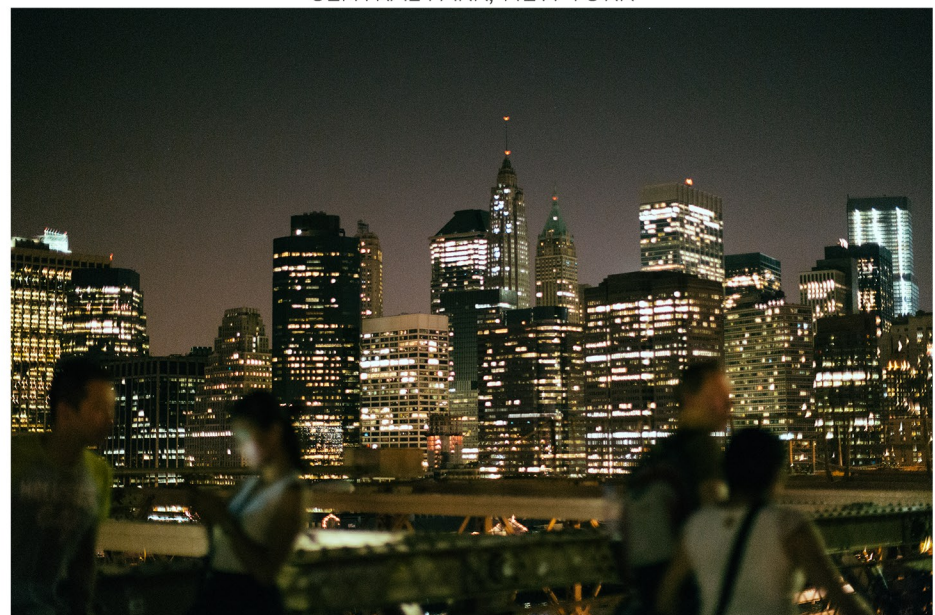
MANHATTAN, NEW YORK