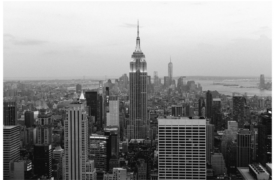
EMPIRE STATE BUILDING, NEW YORK