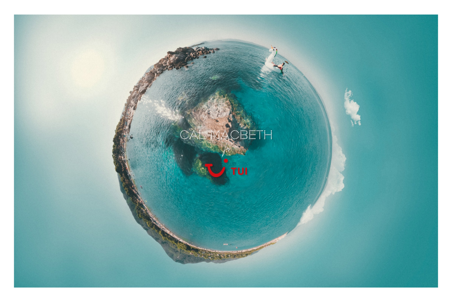
HALKIDIKI, GREECE | TUI TRAVEL