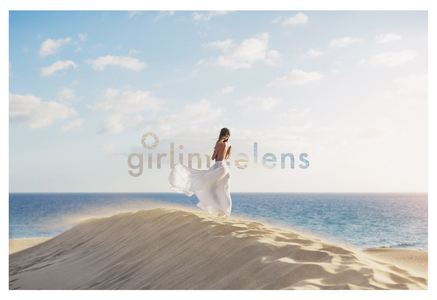
SAND DUNES OF GRAN CANARIA | GIRL IN THE LENS