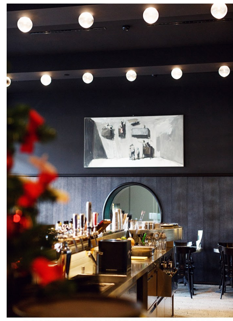
BRASSERIE VOLKSHAUS, SWITZERLAND