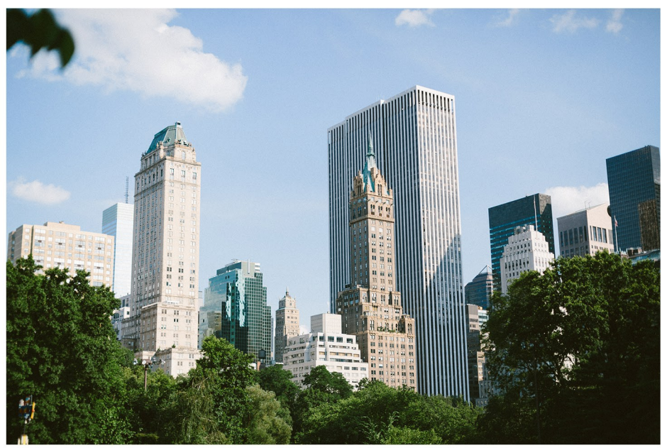
CENTRAL PARK, NEW YORK