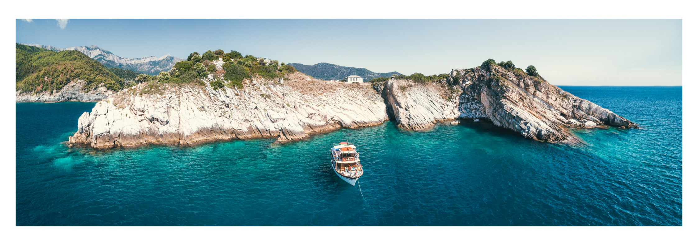
THASOS, GREECE | TUI TRAVEL